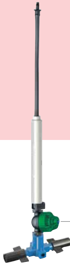
Super LPD (medium pressure)