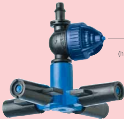
Super LPD (high pressure)

For optimal cooling or humidifying of greenhouses