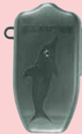
Optional protecting box